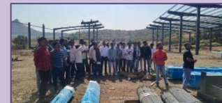
Civil Department visit to Construction Plant at Wai (Satara).